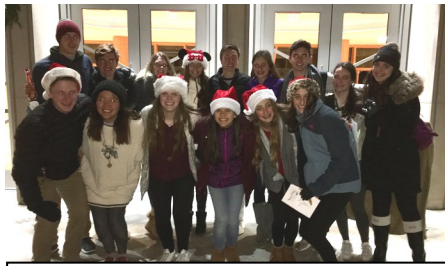
Christmas Caroling - December 2018